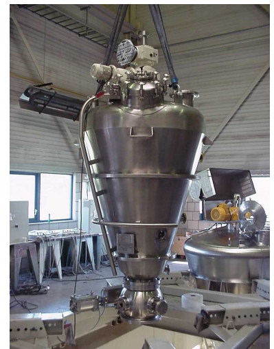
External view Vacuum Dryer

It requires long periods to discharge the horizontal dryer and product losses are considerable. Due to the VERTICAL shape and the agitation of the product in the CONICAL VACUUM DRYER the discharging time is strongly reduced. Product residue in the dryer after discharging are minimal and can be limited to values below 1% Combination of low-pressure and low-temperature drying ensures a good product quality without degradation of product and low product moisture levels.