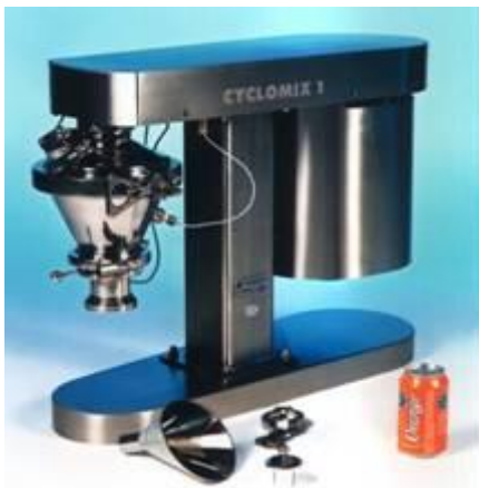
Cyclomix® 1 ltr

Come and see the Picomix at the Achema in Frankfurt am Main in Germany, from 11 – 15 May 2009.