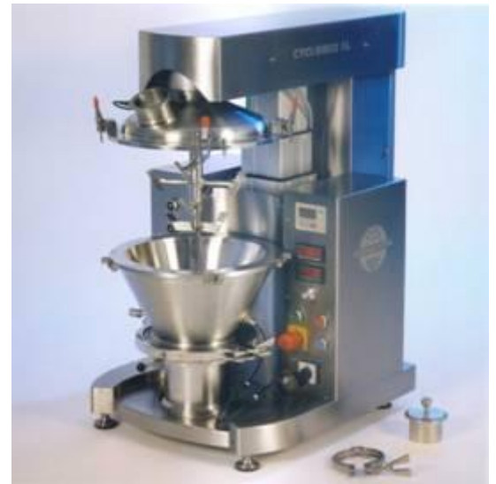
Cyclomix® 5 ltr

INTERESTED in testing one of our mixers in our outstanding test facilities