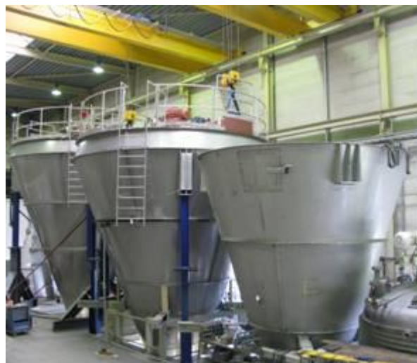
Vrieco-Nauta® mixers, largest 60.000 ltr

To show you the contrast, during the R&D and early stage development work for new products, multiple processes need to be developed and evaluated. However, at this stage the products required for development work or trials are often only available in very small quantities because of the extreme prices of thousands of Euros per gram or because they are simply not existing in larger quantities.