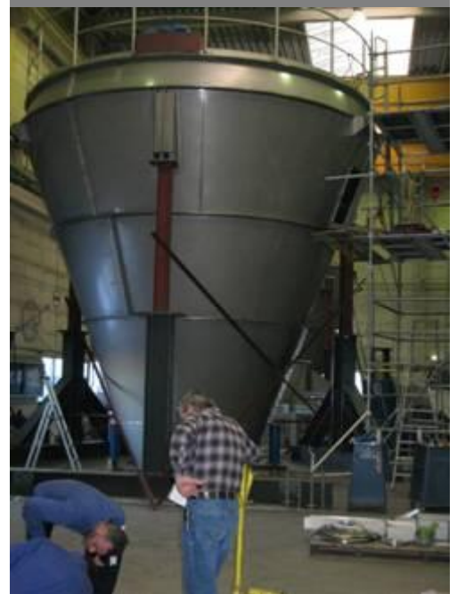
Vrieco-Nauta® mixer 80.000 ltr