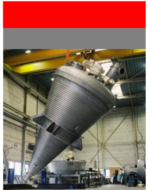
Vacuum dryer 22.000 ltr